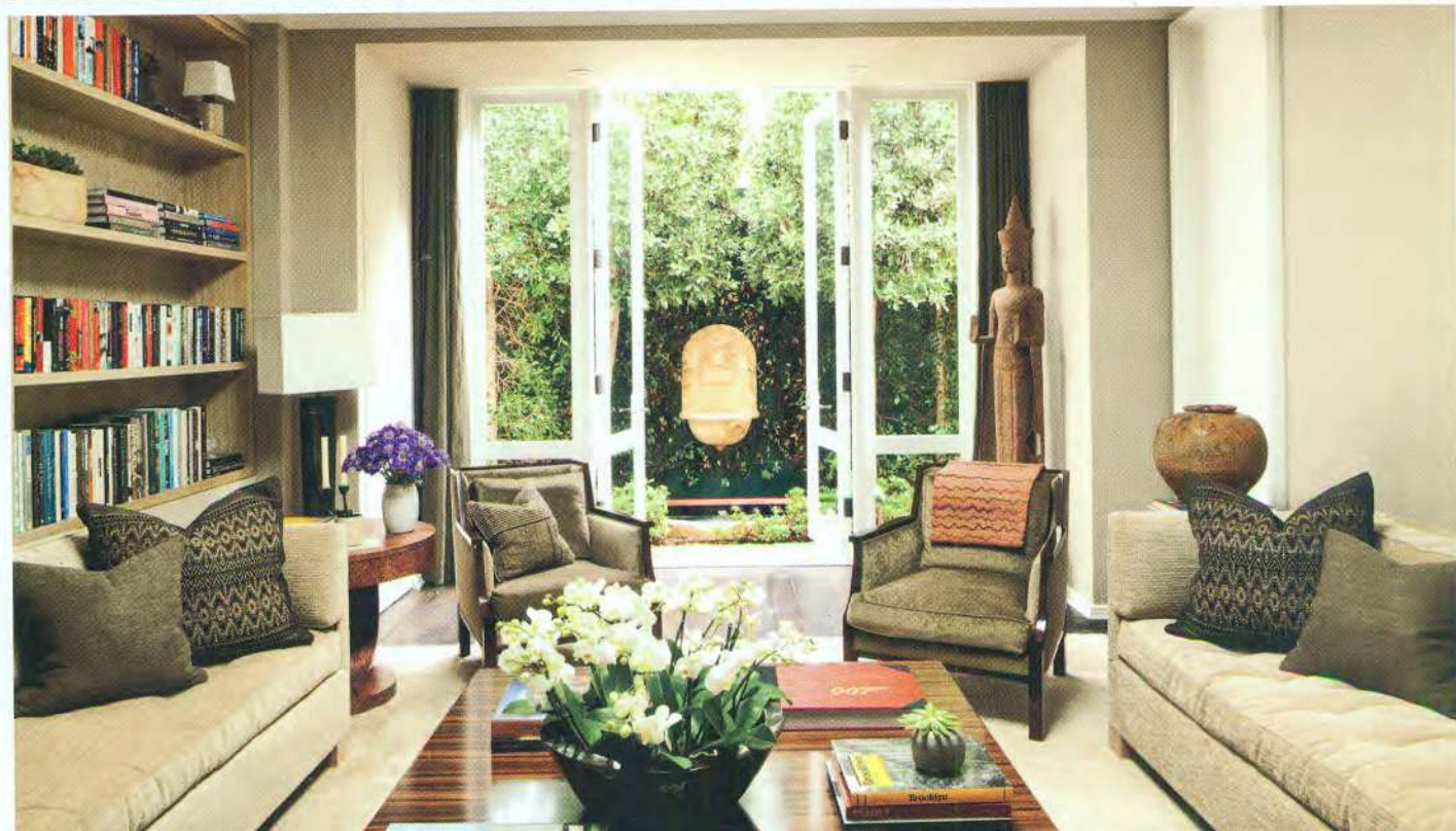
STYLED BY CARLOS MOTA